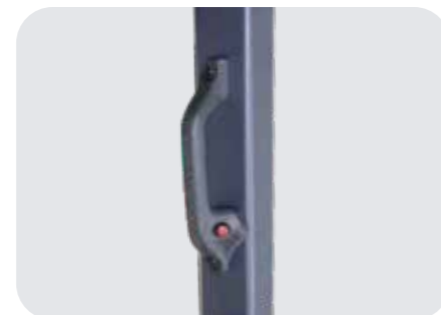
Rear hand holder with horn function (Optional)