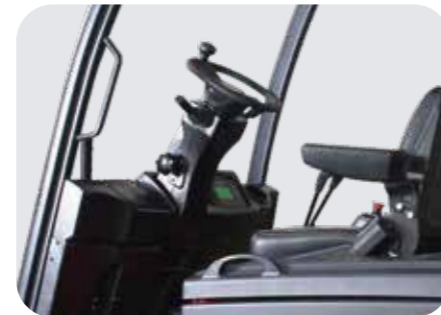
Excellent ergonomic design