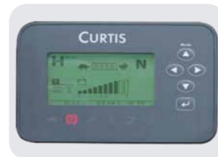
Big LED display