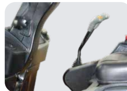
Hydraulic operating handle on the right side