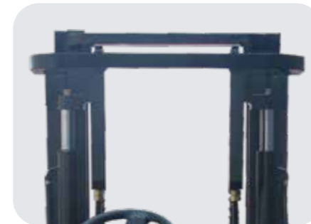
Excellent visibility thanks to optimized