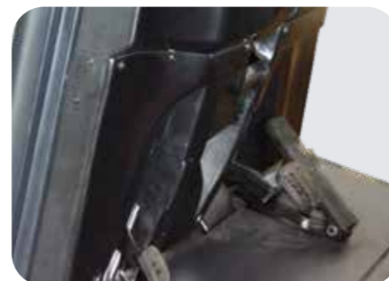
Foot-type parking brake system